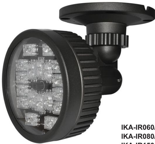
IKA-IR060/60 IKA-IR080/30 IKA-IR150/15